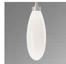
Opal White (WL)