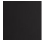
Matte Black (MB)