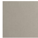
Beige Silver (BS)