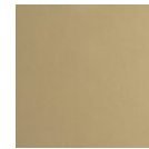
Gilded Brass (GB)