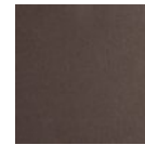
Flat Bronze (FB)