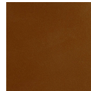
Burnished Bronze (BB)