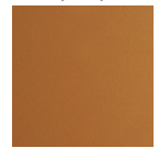
Novel Brass (NB)