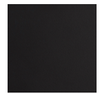
Matte Black (MB)