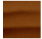
Oil Rubbed Bronze (RB)