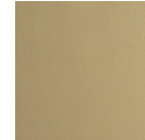
Gilded Brass (GB)