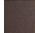
Flat Bronze (FB)