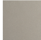
Beige Silver (BS)