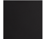
Matte Black (MB)