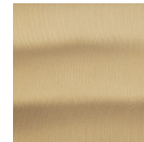
Heritage Brass (HB)