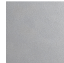
Classic Silver (CS)