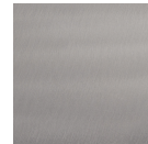
Satin Nickel (SN)