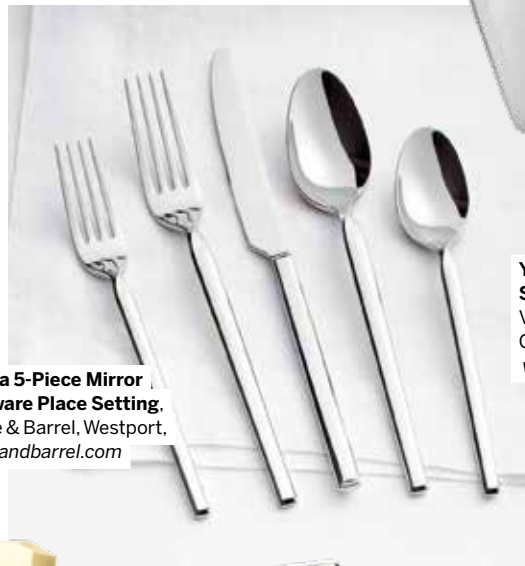
Sylvia 5-Piece Mirror Flatware Place Setting, Crate & Barrel, Westport, crateandbarrel.com