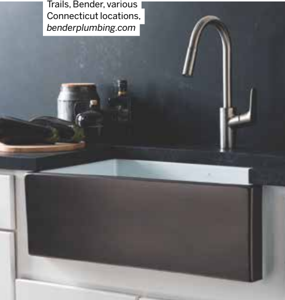
Dreamer Sink by Native Trails, Bender, various Connecticut locations, benderplumbing.com