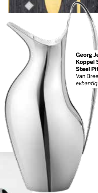
Georg Jensen Henning Koppel Stainless Steel Pitcher, Eleish Van Breems, Westport, evbantiques.com