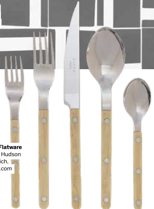
Paris 5-Piece Flatware Place Setting, Hudson Grace, Greenwich, hudsongracesf.com