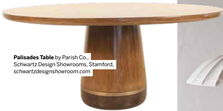
Palisades Table by Parish Co., Schwartz Design Showrooms, Stamford, schwartzdesignshowroom.com