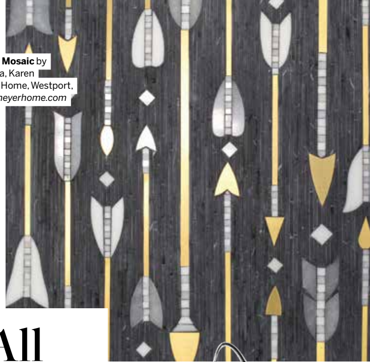
Arrow Rows Mosaic by New Ravenna, Karen Berkemeyer Home, Westport, karenberkemeyerhome.com