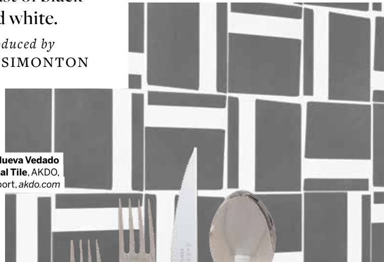
Plaza Nueva Vedado Charcoal Tile, AKDO, Bridgeport, akdo.com