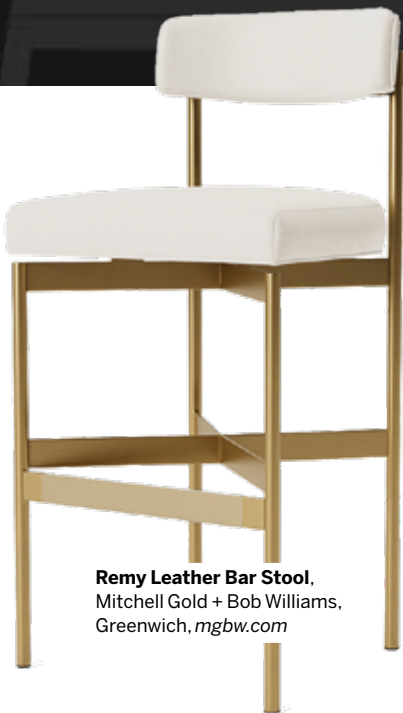
Remy Leather Bar Stool, Mitchell Gold + Bob Williams, Greenwich, mgbw.com