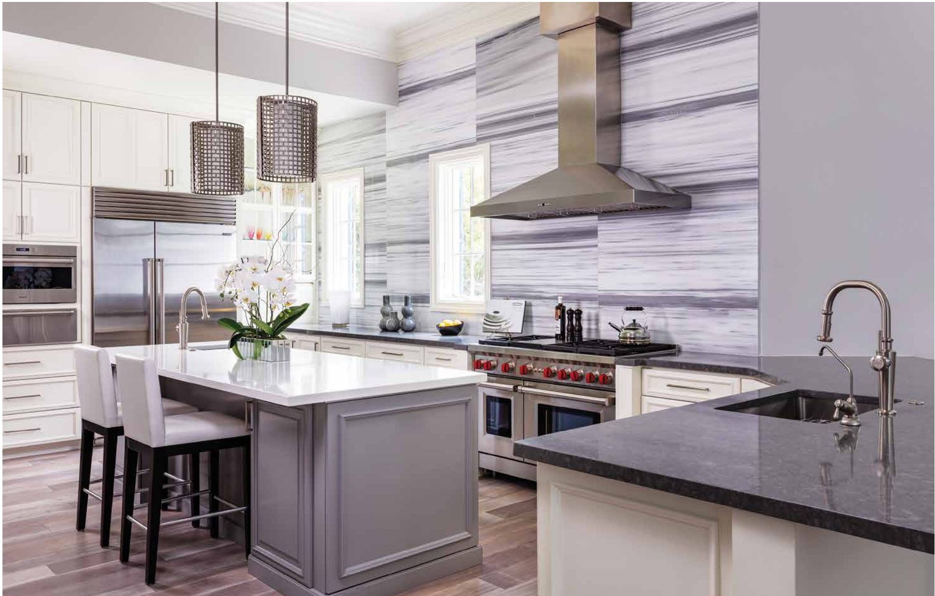
One wall in the kitchen is created with 24-by-36 inch marble panels, which were scarce and difficult to procure at the height of the pandemic.

would fill it and then put everything in a carton and leave it outside the office door.