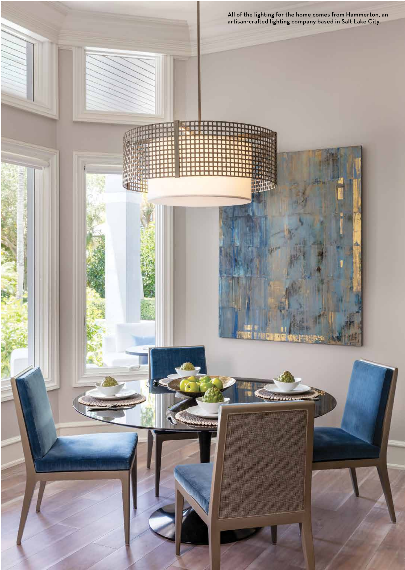
All of the lighting for the home comes from Hammerton, an artisan-crafted lighting company based in Salt Lake City.

Also on the list was the clients' desire to replace outdated lighting,