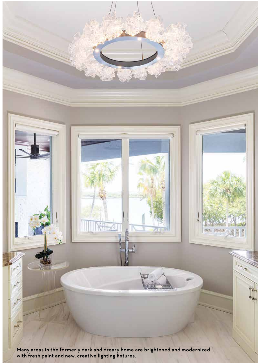
Many areas in the formerly dark and dreary home are brightened and modernized with fresh paint and new, creative lighting fixtures.

That’s where Spectrum and the clients were on that Friday in March two years ago. Today they are cele-