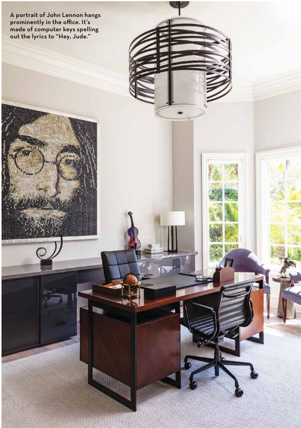
A portrait of John Lennon hangs prominently in the office. It's made of computer keys spelling out the lyrics to "Hey, Jude."

“The clients considered lighting fixtures to be works of art.”